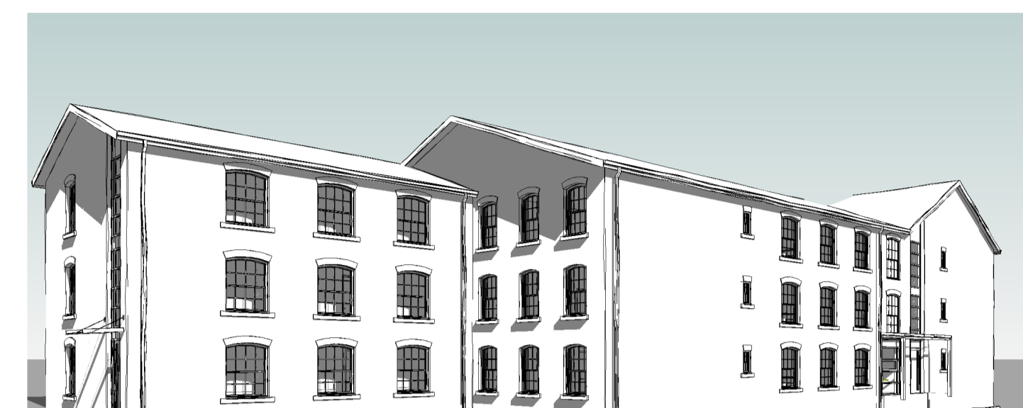
3D View 1